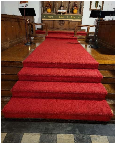
A final Good-bye to the red carpeting that has served us well for many years.